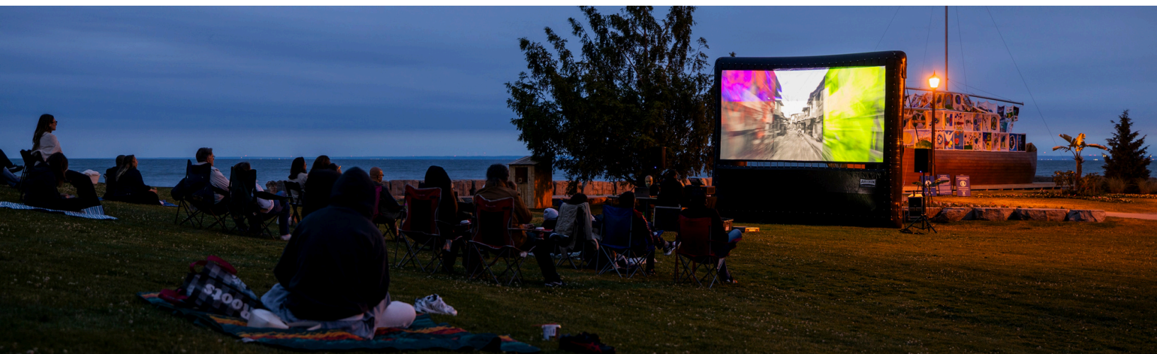
Sunset Kino Film Festival in Gairloch Gardens, 2025.

Perrett Laver is a Data Controller and a Data Processor, and our legal basis for processing your personal data is 'Legitimate Interests'. You have the right to object to us processing your data in this way. For more information about this, your rights, and our approach to Data Protection and Privacy, please see our Privacy Policy .