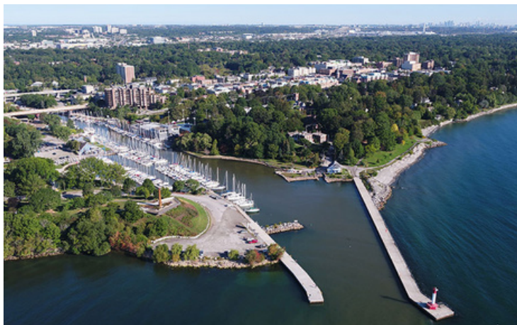
Copyright © 2026 The Corporation of the Town of Oakville.