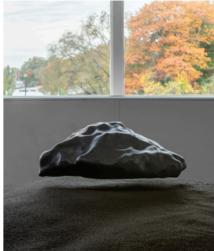
Charles Stankiech: The Desert Turned to Glass, Oakville Galleries in Gairloch Gardens, 2024.