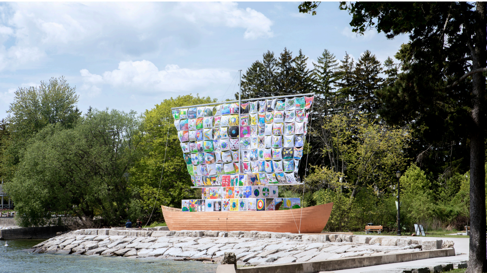
Ilya & Emilia Kabakov: The Ship of Tolerance in Gairloch Gardens, 2026.