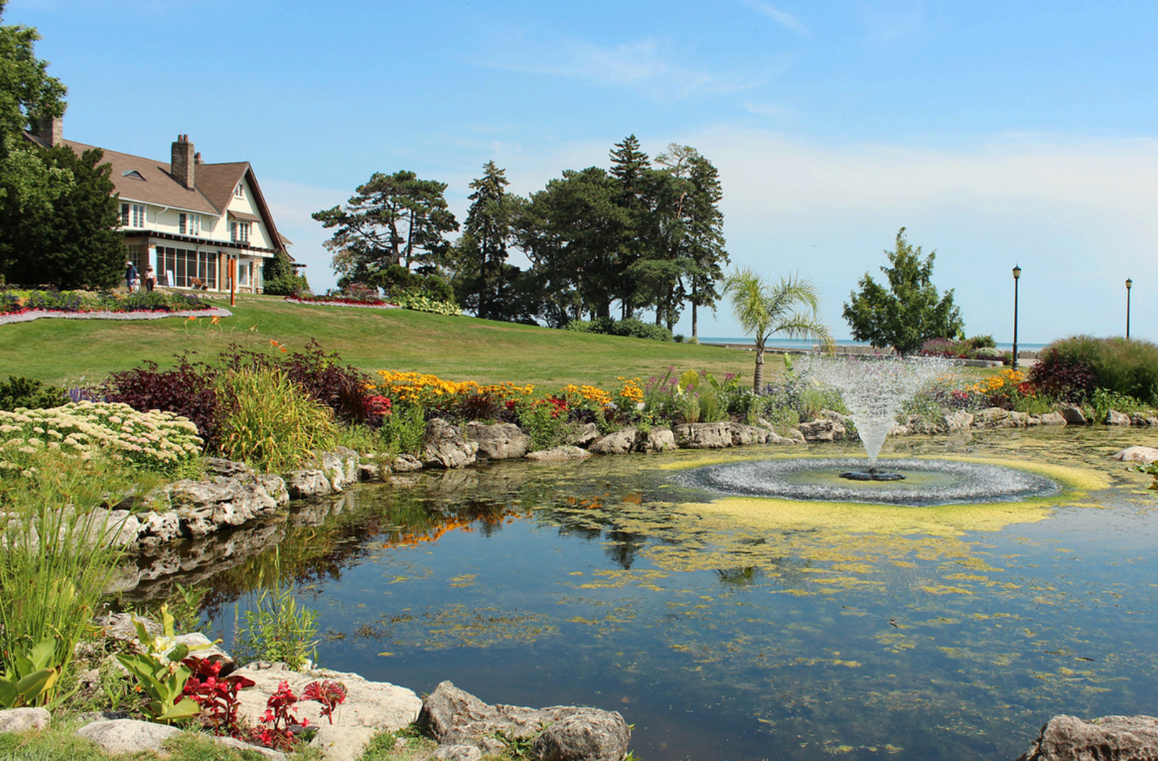
Oakville Galleries in Gairloch Gardens, 2025.