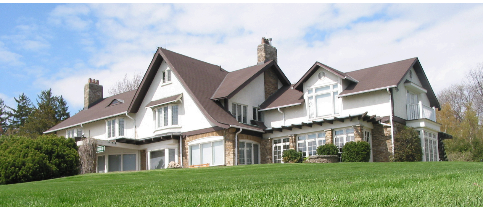
Oakville Galleries in Gairloch Gardens, 2023.

The former residence's first floor now comprises four exhibition galleries, as well as an education centre, which is used primarily for art classes, workshops, lectures, and receptions. The second floor houses administrative office space for staff and another education room, which hosts art classes and workshops. The third floor is used for archives and also contains a small apartment for visiting artists and curators. The white clapboard building north of the gallery was built to Gairdner's personal specifications and was used as a studio in his later life. The Studio, as it is now called, is an elegant event venue available for short-term rentals, such as meetings, workshops and small functions, as well as ongoing curated projects and screenings.